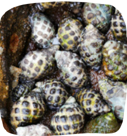
MULBERRY OYSTER BORER

This tiny snail may look like a berry, but is infact a ferocious predator feeding on oysters, tube worms and barnacles.