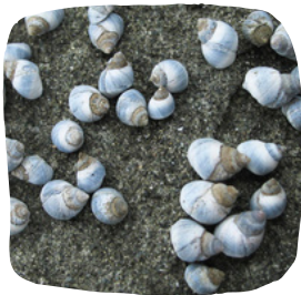
LITTLE BLUE PERIWINKLE

The light blue colour of these snails reflect the sun rays to stop them from heating up on the rocks when the tide is low.