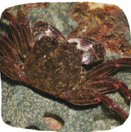
RED BAIT CRAB

This common crab can be found on rock platforms and is omnivorous meaning they eat both plants and animals.